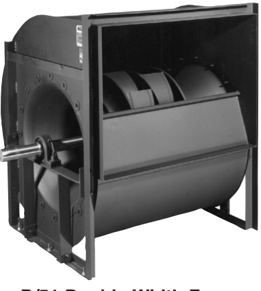
D/51 Double Width Fan